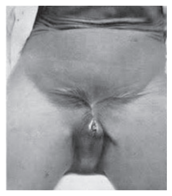
Figure 1. Victim of wartime phallotomy from Abyssinian conflicts of the 1800s (4)