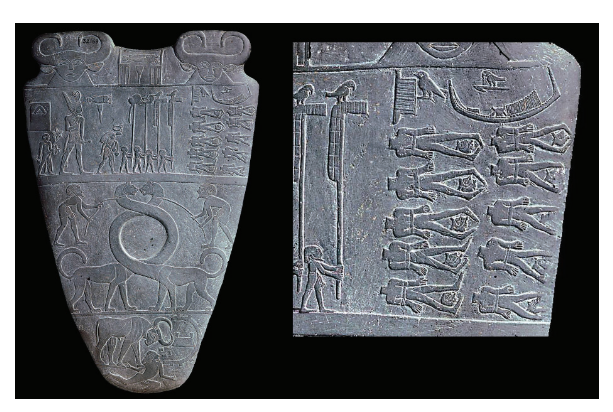
Figure 4. Narmer Palette (left) and magnified section (right) portraying a victory celebration with depictions of decapitated, bound, and slain enemies, with their genitalia placed on their heads (from Mark JJ (20)).