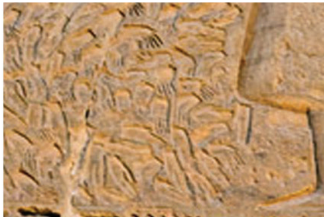
Figure 3. (Left) Hieroglyphics on the Medinet Habu Temple, Luxor Governorate, Egypt, showing offerings of enemy penii to Pharaoh Ramses III after that battle of Khesef-Tamahu. (Right) Enlarged view (From Billington B, 2013 (22))

spanning 5000 years from the earliest Egyptian cultures to the modern era.(20) Trophy taking is rooted in personal efficacy, power, or status, is linked to intimidating one's adversaries, and perpetuates the act of revenge.(6)