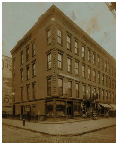
Figure 3. (Left) View of purported Takamine Lab in basement of this 4-story block on northwest corner of East 109th street, New York, NY (Right) 1912 view of a building with similar features including the Italianate cornice dentil mouldings prevalent in 19th century Manhattan.

compound that had withstood the harsh requirements of a hydrolysis procedure in an autoclave. "The dispute between these two authors," Takamine wrote, "was not altogether amicably solved." (1) Abel himself later termed these struggles as "blunders of a pioneer" but did, as Takamine later wrote, "no doubt thrown some light on the chemical side. Unfortunately, he was not working with the active principle but a somewhat modified substance or the benzoyl-compound: and that these substances were "not crystallizable". (14, 15)