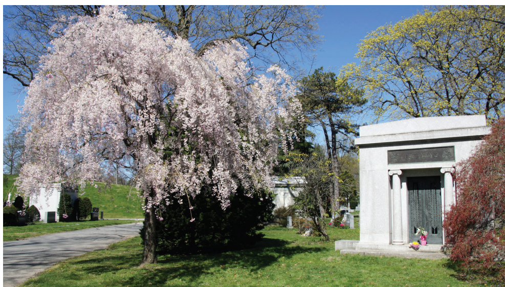
Figure 5. Final resting place of Jokichi Takamine, Takamine plot, Bronx's Woodlawn Cemetery.