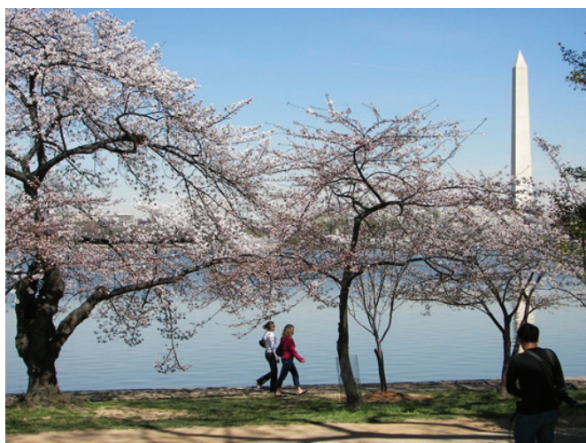
Figure 4. Cherry Trees around the Tidal Basin, Washington D.C. Takamine was a great philanthropist and famously arranged the Japanese donation of thousands of cherry trees to the United States in 1912. (T. Yamashima)