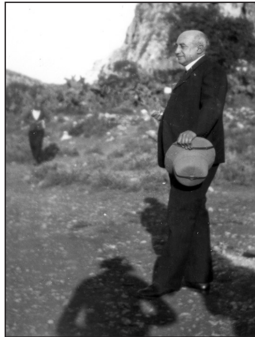
Figure 1. (Left) Dorothy Garrod (1892-1968), born into a household of scholars, became one of the great early 20th century paleo-archeologists, becoming the first female Professor at Cambridge in 1952. Her discovery of the Natufian people rewrote the age of sophisticated human cultures. (Right) Abbé Henri Breuil (1877-1961), Garrod's mentor, who discovered the Ain Sakhri statute and in correctly identified the artwork as Natufian in origin.