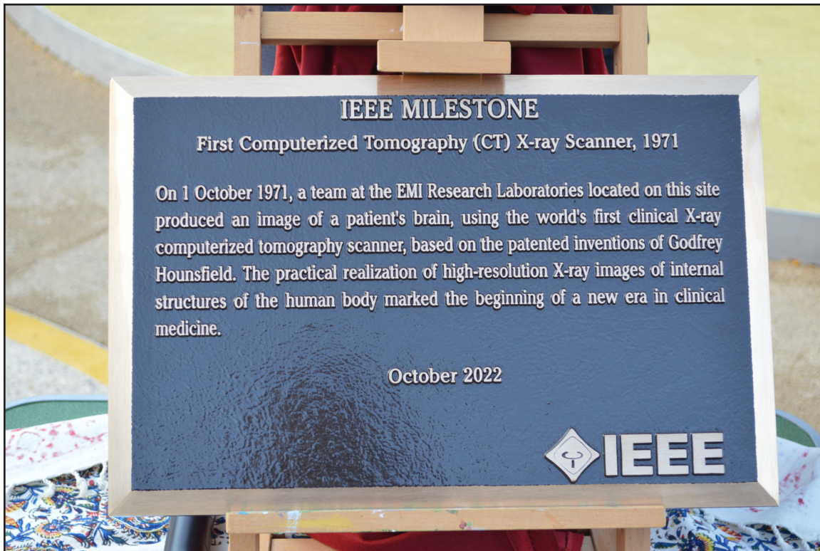
Figure 6. Memorial plaque acknowledging the critical role of the Beatles' record company EMI in the development of the CT scan: "On October 1, 1971, a team, at the EMI Research Laboratories on this site produced an image of a patient's brain, using the world's first clinical X-ray computerized tomography scanner, based on the patented inventions of Godfrey Hounsfield. The practical realization of high-resolution X-ray images of internal structures of the human body marked the beginning of a new era in clinical medicine."

took all night but produced a recognizable image of a brain tumor (Figures 3 and 4). The first EMI production model required 4 minutes per slice and 7 minutes per reconstruction. The first description of a CT scan in the literature was published by Hounsfield in the British Journal of Medicine in 1973. (12-14)