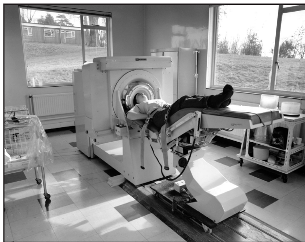
Figure 4. One of the world's first clinically used CT machines, installed in Atkinson Morley Hospital, Wimbledon, England, 1971.

In order to build and test his scanner, Hounsfield needed a lot of help. The initial seed funding came from EMI, but he also had to solicit the UK Department of Health