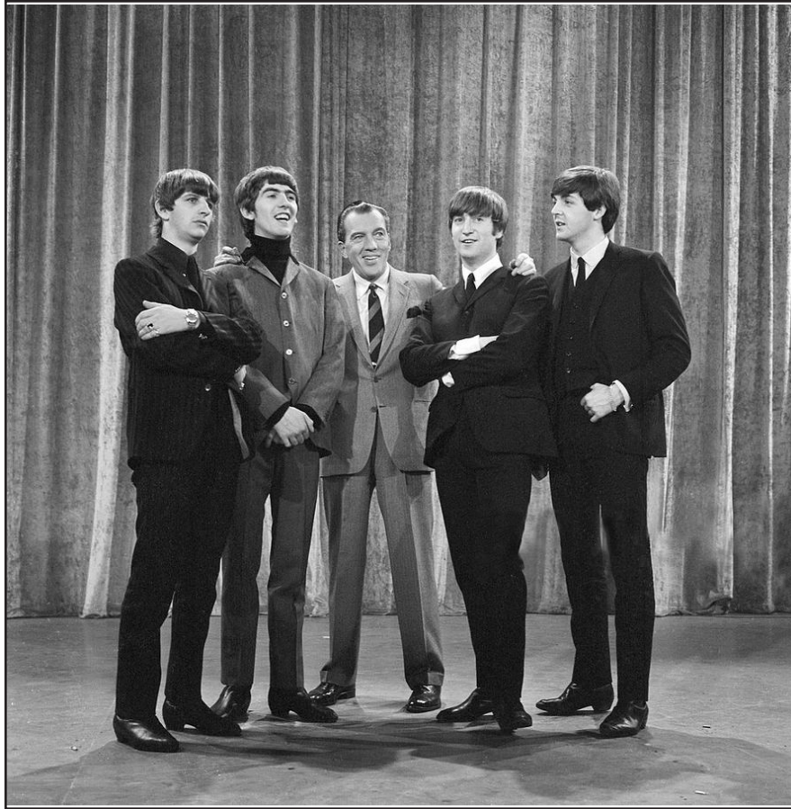
Figure 5. The Beatles, February 9, 1964, with Ed Sullivan (1901-1974), the US TV impresario. The Beatles were an English quartet whose EMI record sales from 1962-1969 allowed EMI to support Hounsfield's research that led to the development of the CT scan. Pictured are (Left to Right): Messrs: Sir Richard Starkey (1940-), George Harrison, (1943-2001), Ed Sullivan, John Lennon (1940-1980), and Sir J Paul McCartney (1942-)

and Social Security for an additional £2,500. (10) He also needed Ambrose's help to work on the clinical aspects of testing the scanner. He would need even more funding when he realized his radiation source was too weak as his initial scan times took 9 days! Another £12,000 later, using x-rays, the scan times were down to a mere 9 hours.