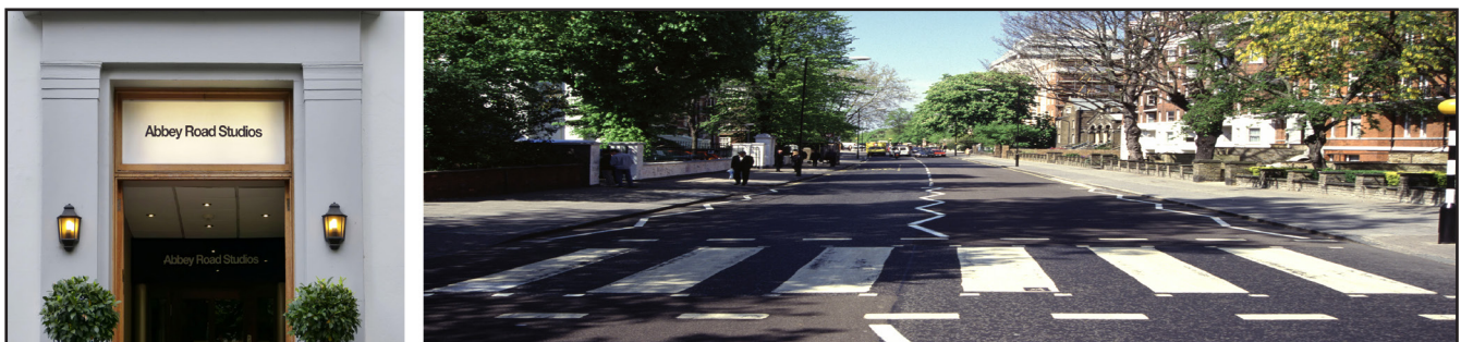
Figure 1. (Left) The front door for EMI's Abbey Road Studio, St. John's Wood, London. (Right) The famous 'zebra crossing' outside Abbey Road Studio, looking due north, and featured on the cover of The Beatles' 1970 "Abbey Road" album.

He enrolled in City and Guilds College in London in 1939 but with the outbreak of World War II, Hounsfield